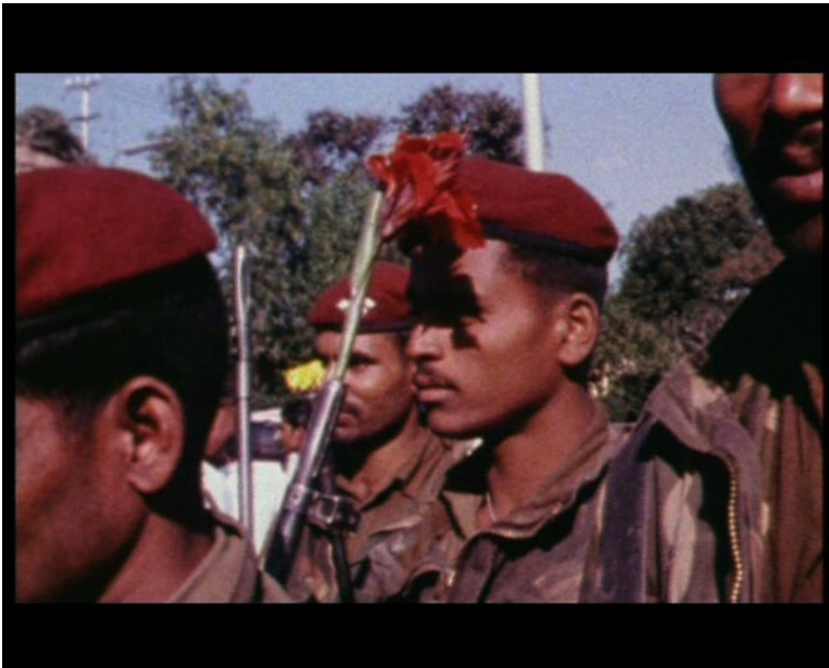
Figure 6. Newsreel footage of Indian soldiers entering Dhaka, December 1971; scene from Muktir Gaan (1995 dir: Tareque & Catherine Masud).