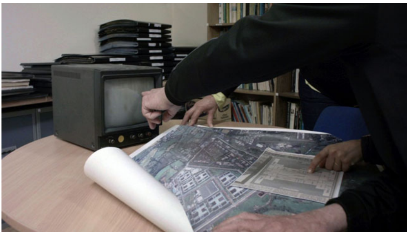
Figure 4. CCTV monitor with screen burn and maps of H-Block in Long Kesh/Maze prison in the Irish Republican History Museum, Belfast, Northern Ireland.

I open the book with a specific incident in Northern Ireland because it is a straightforward example of a material artefact that carries information about the spatial context of a violent event from the past. The material artefact in question is a CCTV monitor that carries a crystalline trace of violence in the form of a screen burn depicting the corridor of H-Block two in Long Kesh prison where Bobby Sands was on hunger strike. It’s a static image without any kinetic movement that would indicate human presence, but it is a reminder that technologies of image capture were on the scene for years thus corroborating the fact that this place and the horrific events that took place within its architecture actually existed. The screen burn functions as a material witness according to my formulation. Having said that, I think we need to consider carefully when it is productive to use