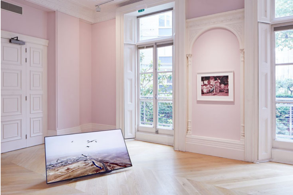
Figure 9. Heba Y. Amin, The General's Stork , 2020. Installation at The Mosaic Rooms, London, 2020/2021.

meaning transformed through digitisation, specifically where memories are encapsulated in the material realities of the digital and thereafter generated or accumulated through processes of deterioration?