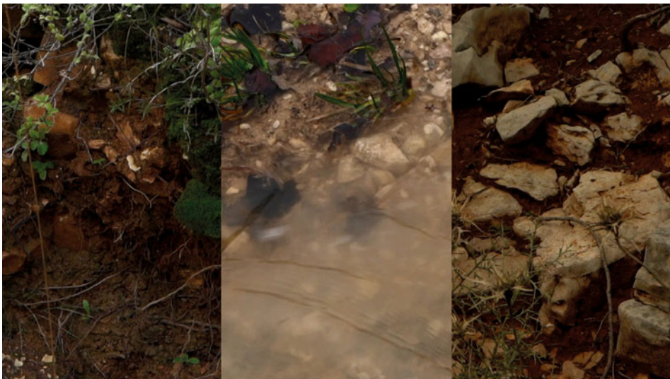
Figure 2. Helene Kazan, Frame of Accountability: (Un)Touching Ground , 2022. Digital film still.

( Un ) Touching Ground engages a decolonial archival practice to create what I term as legal fiction, activating feminist and artistic methods towards a wider engagement in international legal justice. This particular episode traces the human and non-human effects of these events to undo a temporal-spatial distance constructed in distinguishing this violence as environmental and conflict-based. It, literally, follows the roots of the violence and the three directions of the attacks through Lebanon. Rather than showing a colonial map, I bring the audience to touch the ground in an embodied experience of that space.