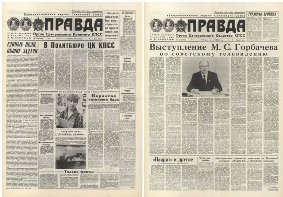
Figure 7. Cover of Pravda newspaper, April 26, 1986, day of the Chernobyl nuclear accident and cover of Pravda newspaper, May 15, 1986. Nineteen days after the accident at Chernobyl, President Mikhail Gorbachev made a television address to the Soviet people.

In relationship to Heba's point vis-à-vis history, I was thinking about Harun Farocki's film Images of the World and the Inscription of War (1988) and the image of the Auschwitz concentration camp that was captured incidentally at an aerial flyover as part of American surveillance efforts. It is not until the 1970s that the image is discovered and its significance is realised. I think that there are a lot of images whose full potential to speak back to certain histories operates as a latency that is not yet fully recognised. Some of the image practices in Palestine documenting daily life under occupation form part of this visual archive that is being produced for a future in which there might be some mechanisms of accountability or legal frameworks where this documentation would speak to the coercive state practices that govern the everyday mobility and life worlds of Palestinians. There are many photographers producing images that are