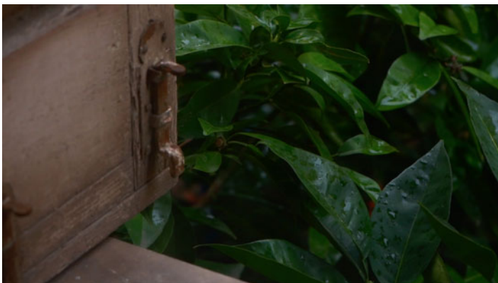
Figure 3. Helene Kazan, Frame of Accountability: In Her View , 2022. Digital film still.

Anthony Downey: What I find particularly interesting is the extent to which we are not just dealing with the “what” of images, the informational value of images; we are dealing with the “how” of images, the apparatus of image production, the materiality of the image itself as well as of its means of production. I want to turn to Susan Schuppli in this respect: I was very taken by one specific quote in your book, Material Witness: Media, Forensics, Evidence , which outlines your understanding of the material as a witness; or materiality as a form of witnessing in and of itself. If I may, I will read from the book in question: “This book introduces a new operative concept – material witness – an extrapolation of the evidential role of matter as registering external events as well as exposing the practices and procedures that enable such matter to bear witness.” (Schuppli 2020, 3). In this context, you open the book with an extraordinary account of a CCTV monitor taken from Long Kesh prison in Northern Ireland where Bobby Sands died while on a hunger strike in 1981. This monitor is instrumental in your argument, not for what it transmitted at the time, but for the material residue, a slow burn of the prison's architecture into the TV screen, and the form of material